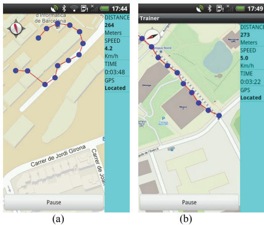
Figure 2: Screenshots: route tracked using Google Maps (a). Route tracked using OpenStreetMap (b).

The application has provided us useful types of data to analyze social activity. In the application the number and time when an SMS is sent or received has been monitored. It also has allowed tracking the duration, the number and the time of outgoing and incoming phone calls. Concerning the social networks, the application has been capable to analyze the activity on Facebook and Twitter. The application has obtained the number of friends that is associated with the contact network size. In addition to measure the social activity, the wall panel, messages and notifications have been checked. On Twitter social network published tweets by the user, mentions, direct messages, the number of followers and “following” have been quantified.