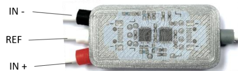
Fig. 2. Sensor inside with pin connections (IN+/-, REF)