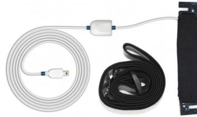
Fig. 1. Respiration (PZT) sensor.

The biosignalsplux piezoelectric Respiration (PZT) sensor is an entry-level and affordable solution for basic respiration data acquisition. This sensor consists of a wearable chest-belt with an integrated localized sensing element that measures displacement variations caused by the volume changes of the thorax or abdomen during respiratory cycles (inhaling/exhaling). The elastic chest-belt can be adjusted in length to be applicable on different anatomies (e.g. male and/or female), body locations (e.g. thorax and/or abdomen), and thorax/abdomen circumferences. Typical applications of this sensor include respiration monitoring to determine respiration cycles, rates, relative amplitudes, and other features.