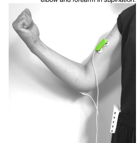
Fig. 4. Example electrode placement of the assembled version along the muscle fibers.