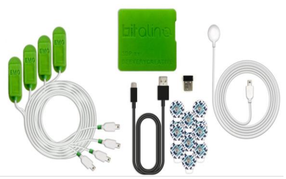
Fig. 1 MuscleBIT bundle.

The BITalino MuscleBIT bundle designed for everyone who wants to measure muscle activity by evaluating electromyography (EMG) signals. This bundle is completely assembled with our 3D Printed Casing for BITalino (r)evolution Plugged making it more convenient to use, wearable, sharable & transportable. The four Assembled Electromyography (EMG) Sensors with SnapBIT-DUO repeatedly accurate & fast measurements, once the user can benefit from the prefixed electrode distance, 1-lead cable for each sensor (instead of 2-lead or 3-lead cable) and one reference cable for all sensors connected.