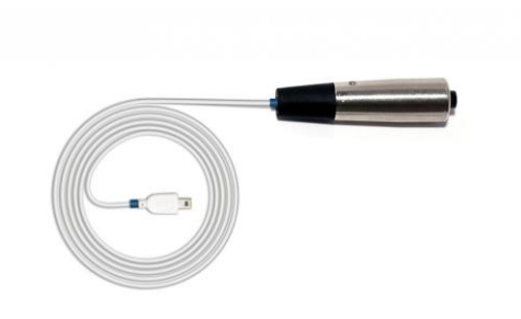
Fig. 1. Ergonomic handheld design.

The use of this accessory to trigger the start of an acquisition is only supported on 8-channel biosignalsplux hubs as it must be required to the digital / accessory port of the biosignalsplux device for this purpose.