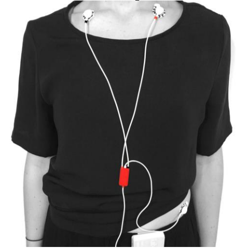
Fig. 4. Example of an assembled ECG placement with IN+ & IN- on the collarbones acc. to Einthoven Lead I from right arm to left arm and REF on the iliac crest.