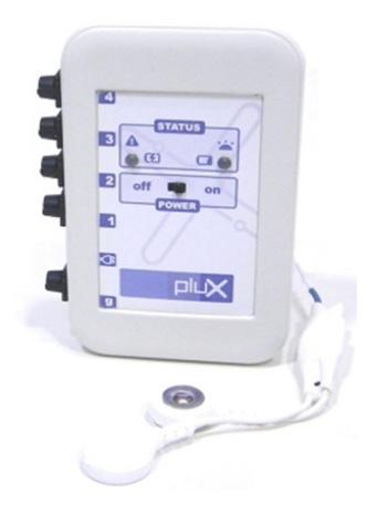
Figure 1. bioPLUX biosignal acquisition device

performance of prescribed exercises at home. In particular, it is inspired by recent developments in bio-monitoring for physiotherapy such as the bioPLUX Clinical system (Figure 1, www.plux.info). This is a compact wireless biosignal acquisition unit capable of streaming live data in real-time to a base station. Sold as a clinical analysis service, it enables therapists to use Electromyography (EMG) to measure and display muscular activity during clinical sessions. The system's compact and robust form factor also makes the underlying technology ideal for home health monitoring, such as continuous monitoring in ambient assisted living scenarios [31].